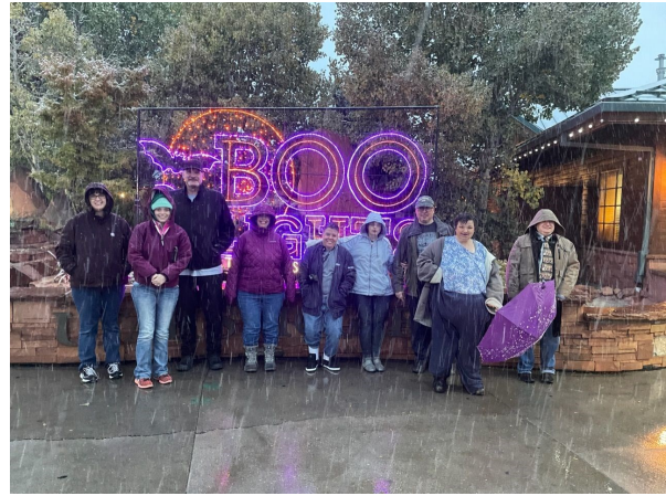
Afton and Thayne Went To Salt Lake City, Utah Boo Lights